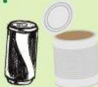
Cans and Tins